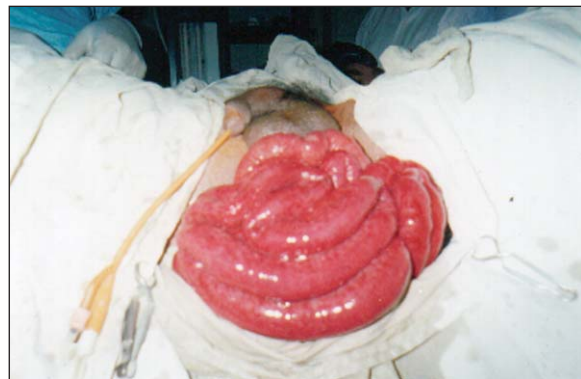
Fig.-2 : Extrusion of the small gut with complete rectal prolapse. (Lithotomy position).