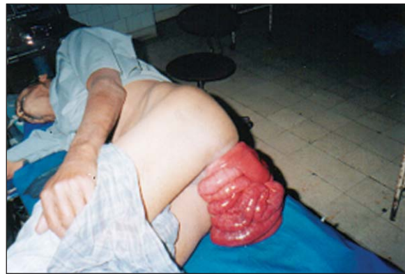
Fig.-1 : Extrusion of the small gut with complete rectal prolapse. (Right lateral position).

On Examination, the patient was found very pale, anxious and dehydrated. He was rolling on the bed. His clothing's and quilt were soaked with blood. His entire small intestine, the mesentery and rectum were found outside the perineum. The anal sphincter was characteristically patulous.