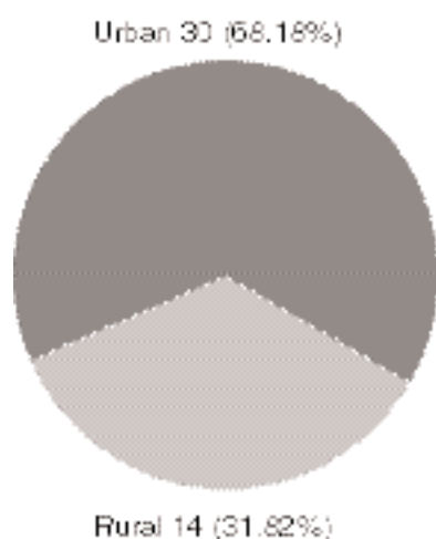
Fig-1: Urban versus rural distribution of HEV cases